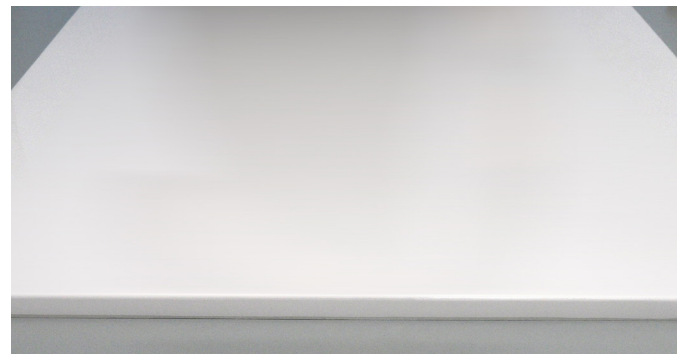
4. Restored surface.