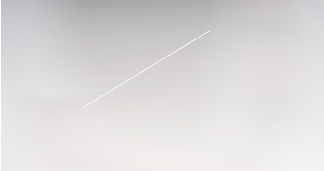
1. Scratched area